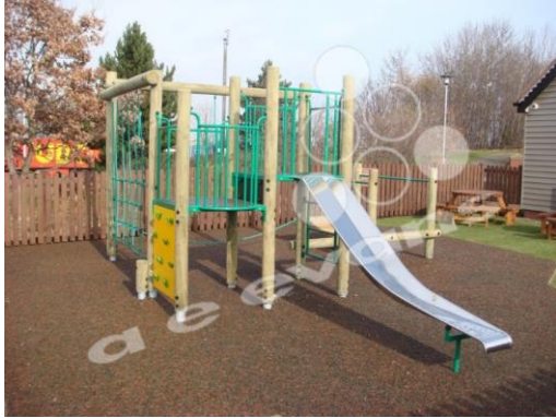
7. Humber Tower