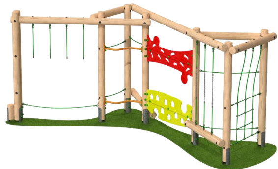
4. Play Frame Challenge 4