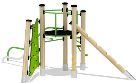
5. Orchard Rowan