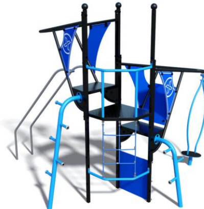
6. XS Cyclone Baroc