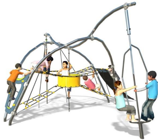
8. Play dale Nucleus