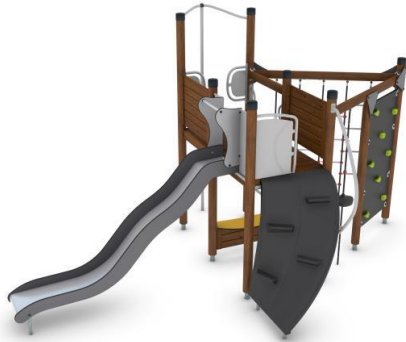
1. Uniplay fogus

Please vote for your top three play equipment and send to emma.mortimer@derbyshiredales.gov.uk or call 01629 761392 by 29 th January