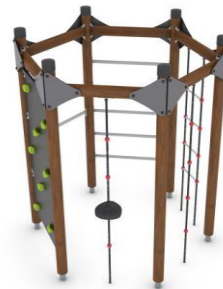
2. Uniplay Gytro