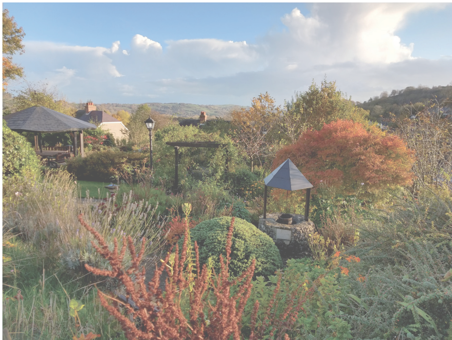
Autumn colours in the millenium gardens